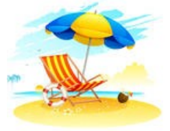
Illustration by GERTIE

Please sign up on the list board in the main hall.