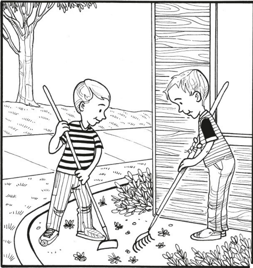
FRIEND NOVEMBER 2009

These children are cleaning up around the Church. See if you can find an ant, a hat, a boot, a ducks head, a feather, a fork, a leaf, a pen,, a shark, a swan, a wristwatch & a woman's shoe. Then colour this picture.