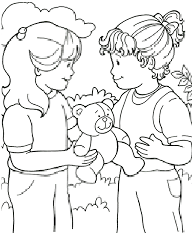
I can follow Jesus by sharing.