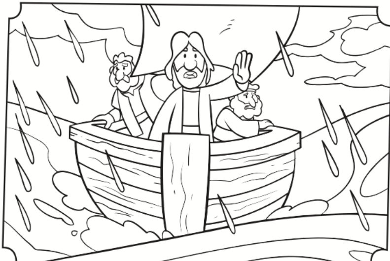
Jesus calmed a storm while He and His disciples were on a boat. Mark 4:35-41

Please feel free to talk to any of the helpers at a Messy Session with ideas or concerns or just for a chat.